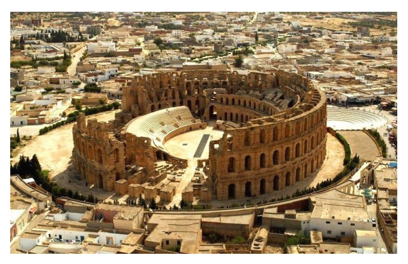
Carthage, the famous ancient city:

https://guide-voyage-tunisie.com/en/sidi-bou-said-town