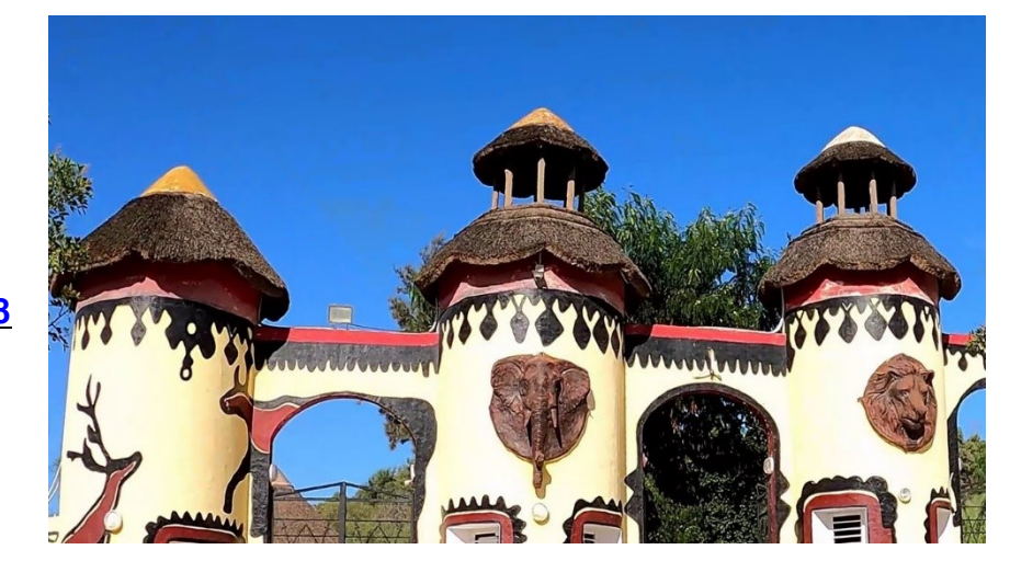
The Friguia Parc zoo www.youtube.com/watch?v=Le2r4lklUd8

https://guide-voyagetunisie.com/en/carthage-land-inhammamet