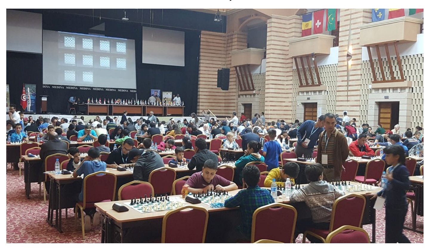
A multipurpose plenary room Hannibal (2200 people), a Caesar amphitheater (600 people), an Odyssey amphitheater (350 people), 25 sub-committee rooms (between 50 and 250 people)

The Medina Congress Centre offers a full range of rooms with modern equipment, making it the ideal place to host the playing area, analysis and arbiter's rooms, ancillary activities and the closing ceremony.