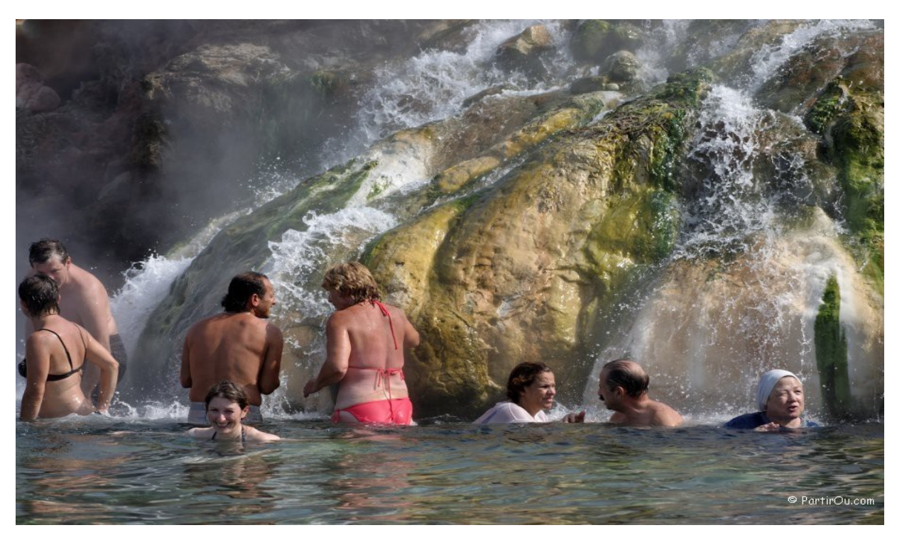
The hot springs of Korbous

https://www.youtube.com/watch?v=jgGfV5PO78Q